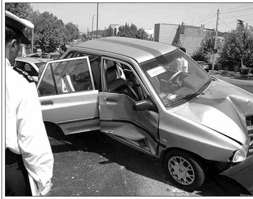
Of the 663 accidents last week, 73 resulted in death and 590 in injuries.

TEHRAN, July 1 —A senior police official Hadi Hashemi said on Saturday 112 people were killed and 899 injured in car accidents across the country last week.